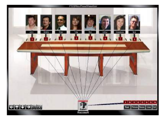
Board Room Perfect for setting for far end camera control with presets for each board member seat.